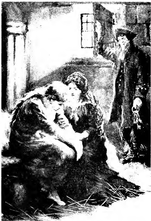
H.M. "The sisters sat down side by side." De Waa